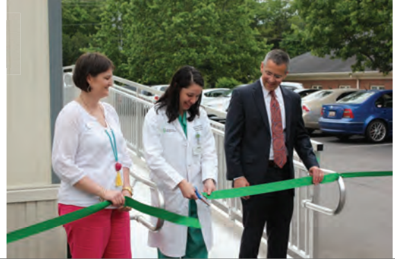
Staff from Greenville First Steps, Greenville Health System, and the YMCA at the ribbon cutting for the new childcare building for CenteringPregnancy

CenteringPregnancy is a CenteringPregnancy® is group prenatal care. Greenville First Steps partners with Greenville Health System and the YMCA of Greenville to fund a childcare center on site at the OB/GYN clinic. Too many mothers who already had children were unable to participate in CenteringPregnancy due to lack of childcare. By offering free childcare during sessions, more mothers are able to receive quality, group based prenatal care.