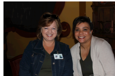
Palmetto Shared Services Advisory council members attend the kickoff event in June.