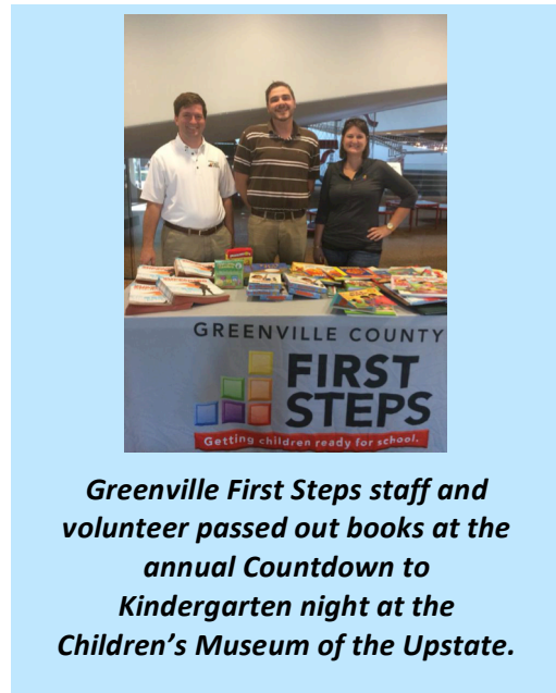
Greenville First Steps staff and volunteer passed out books at the annual Countdown to Kindergarten night at the Children’s Museum of the Upstate.

*CTK program data is for June-August 2015, whereas CTK fiscal data includes expenditures from July 1, 2015 through June 30, 2016.