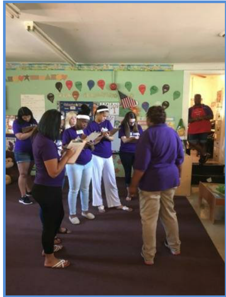
Babysteps participants take a tour of Unique kidz at Davis Academy and learn what quality childcare looks like.

Teens earned Baby Bucks during classes and were able to “shop” in the Little Steps baby boutique to receive essential items such as diapers, baby and maternity clothes, strollers, high chairs, and toys. Throughout the summer and during the following school year, all BABYSTEPS participants who had a child were given a full scholarship to a pre-approved high quality childcare center